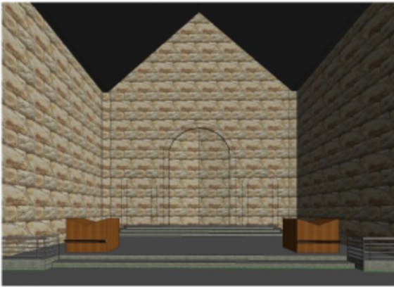
④ 3D View 2